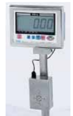
Audible device (factory option)

As an option, audible judgement is possible and it helps much the work efficiency.